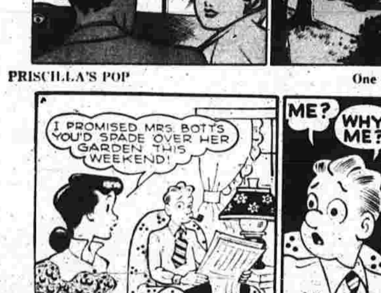
PRISCILLA'S POP One Good Turn—