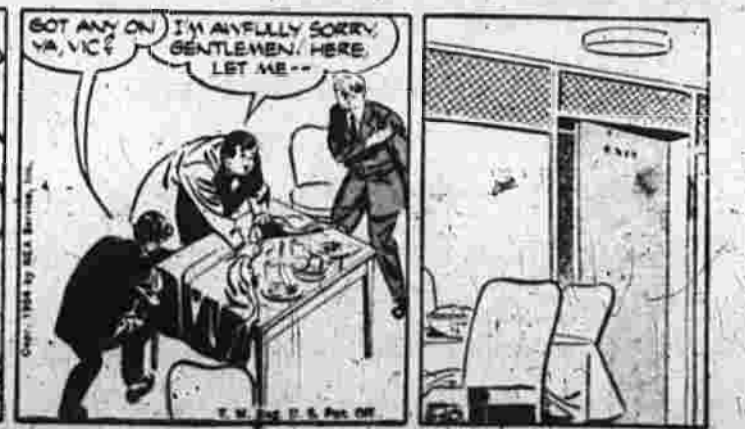
THE STORY OF MARTHA WAYNE Love Is Second Fiddle