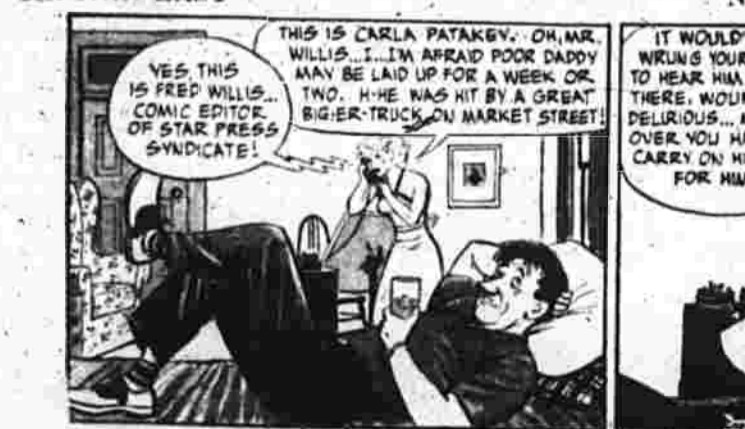
CAPTAIN EASY No Escape