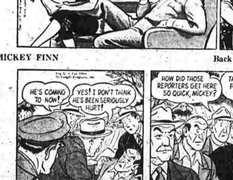
MICKY FINN Back in Form