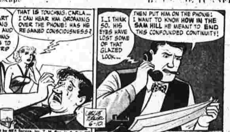
THE STORY OF MARTHA WAYNE Love Is Second Fiddle