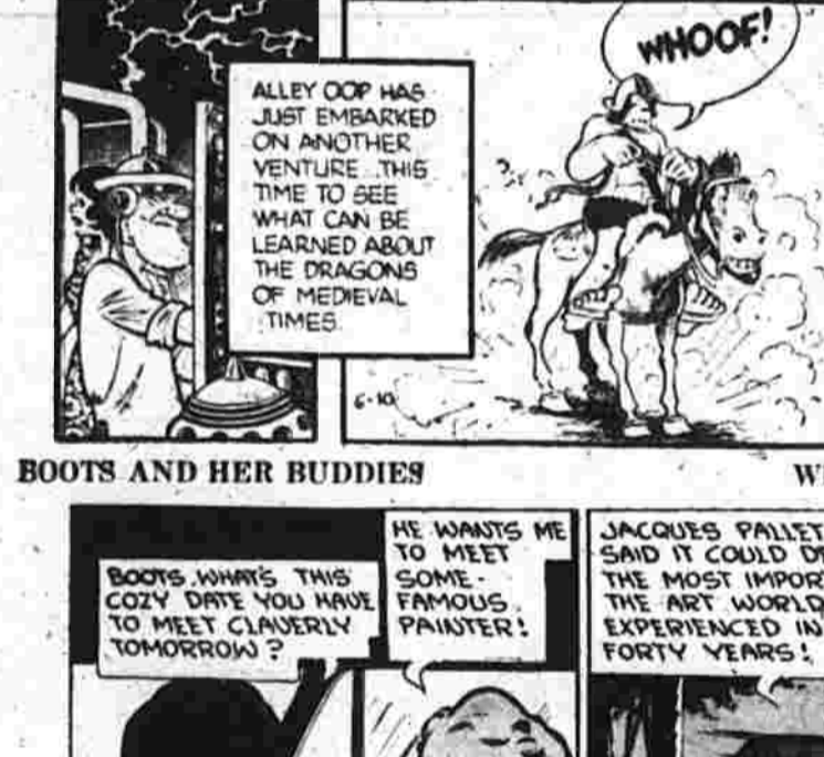
BOOTS AND HER BUDDIES What Goes?